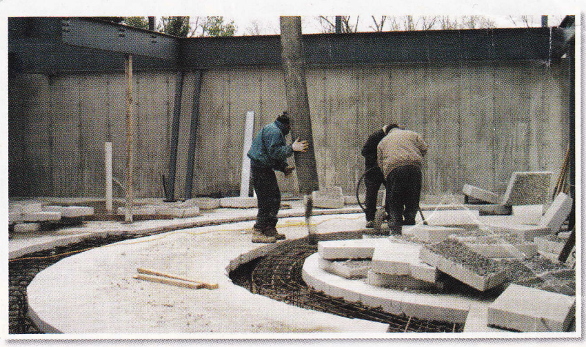
Workers lay the foundation for the Toronto Sportsmen's Show Amphitheatre, part of the new O.F.A.H. | Mario Cortellucci Hunting and Fishing Heritage Centre which is slated to open in the spring.

More great news for the O.F.A.H.|Mario Cortellucci Hunting and Fishing Heritage Centre! The Toronto Sportsmen's Show (T.S.S.) has come on board the heritage centre project with sponsorship of the state-of-the-art amphitheatre, currently under construction at the O.F.A.H. Ontario Conservation Centre site in Peterborough.